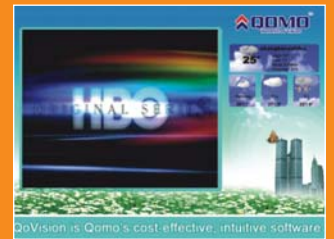
QoVision is Qomo's cost-effective, intuitive software