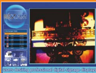
users desiring professional digital signage displays