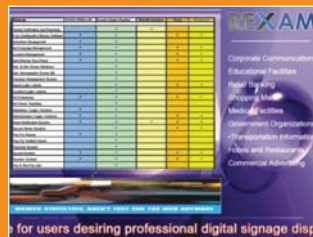
for users desiring professional digital signage displays