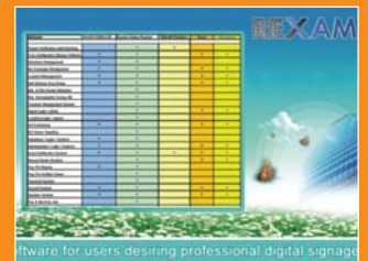
software for users desiring professional digital signage